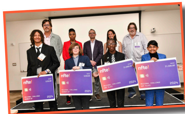
Our 2024 finalists and judges