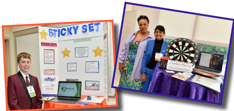
Highlights from the expo 2024