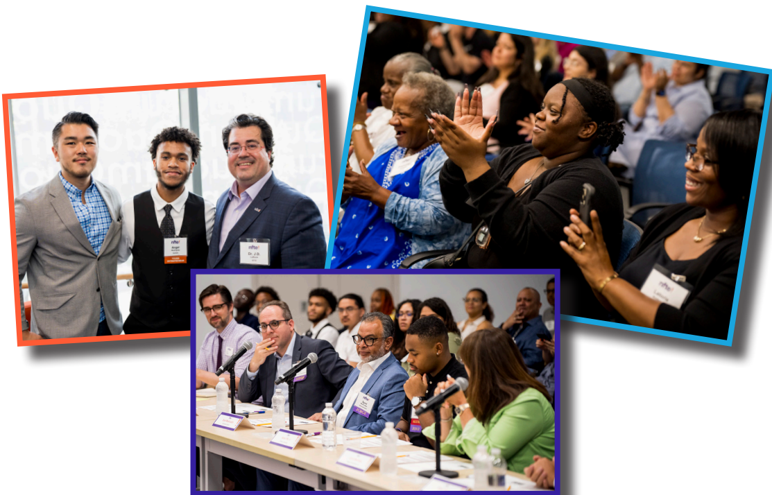
Highlights from the 2024 Challenge