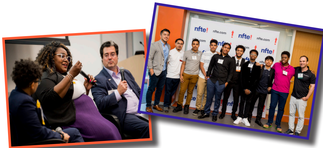
Highlights from the 2024 Challenge